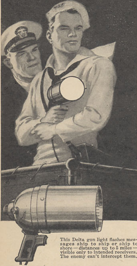
This Delta gun light flashes messages ship to ship or ship to shore—distances up to 5 miles—visible only to intended receivers. The enemy can't intercept them.

Much of this war and its training takes our armed forces into the night—into places where light is urgent and vital, and where it must be ingeniously used.